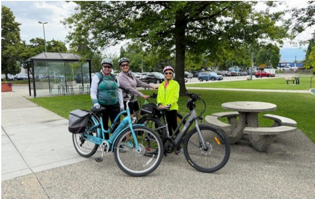
The E-Bike group getting ready for a ride!

Let's keep riding as long as weather permits! Please contact Lynne Cousins for further information. cousinslynn@shaw.ca