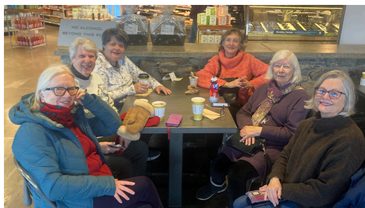
Walkers enjoying a coffee after a brisk January walk