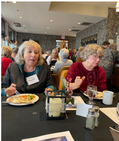
Members enjoying the delicious Christmas lunch