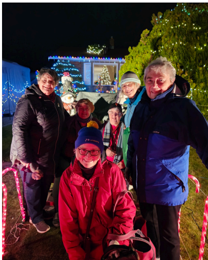
A December walk along Candy Cane Lane