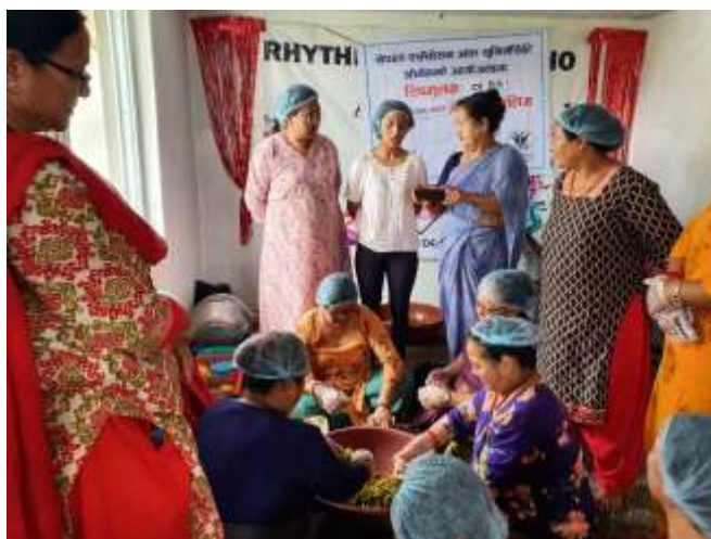
Pickle Making Training at Chapagaon as part of collaboration with Finnish Graduate Women