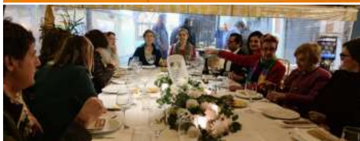
Both photos correspond to the inauguration of the Murcia Association on March 8, 2022.