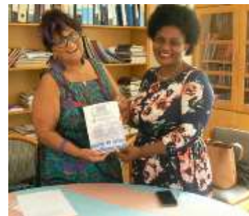
Cape Town meetings