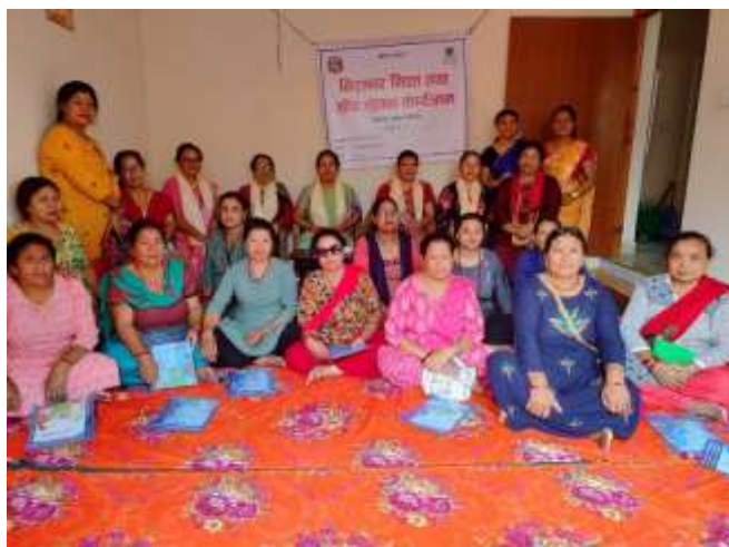
Nonformal Education at Bagdol as part of Bina Roy Project 2021