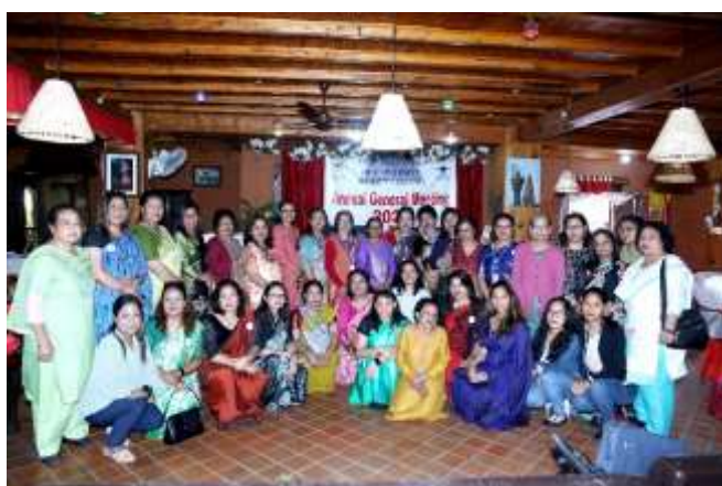
Annual General Meeting of NAUW-2022